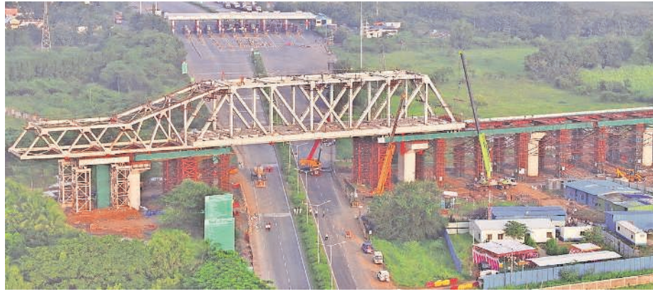
The steel bridge is located near Kamrej Toll Plaza Express